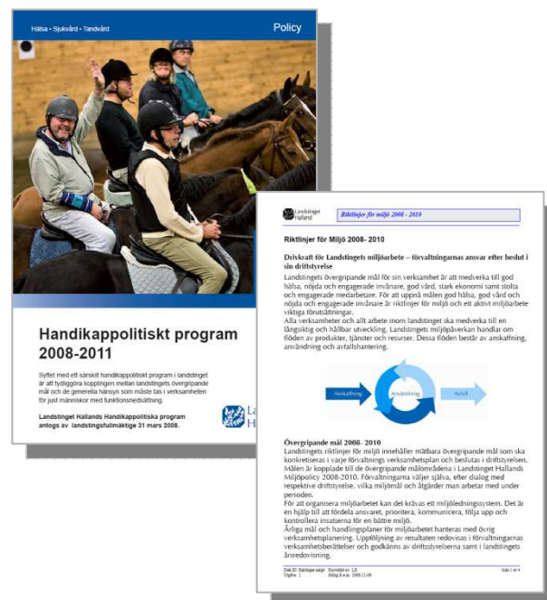
Figure 1: Snapshot of guidelines in PTS.

PTS contains guidelines which set the overall values and requirements for standards in premises for healthcare. Guidelines such as acoustics, fire prevention, environmental requirements, hygiene and accessibility (disability) are specified in PTS (Landstingsfastigheter i Jönköping 2010).